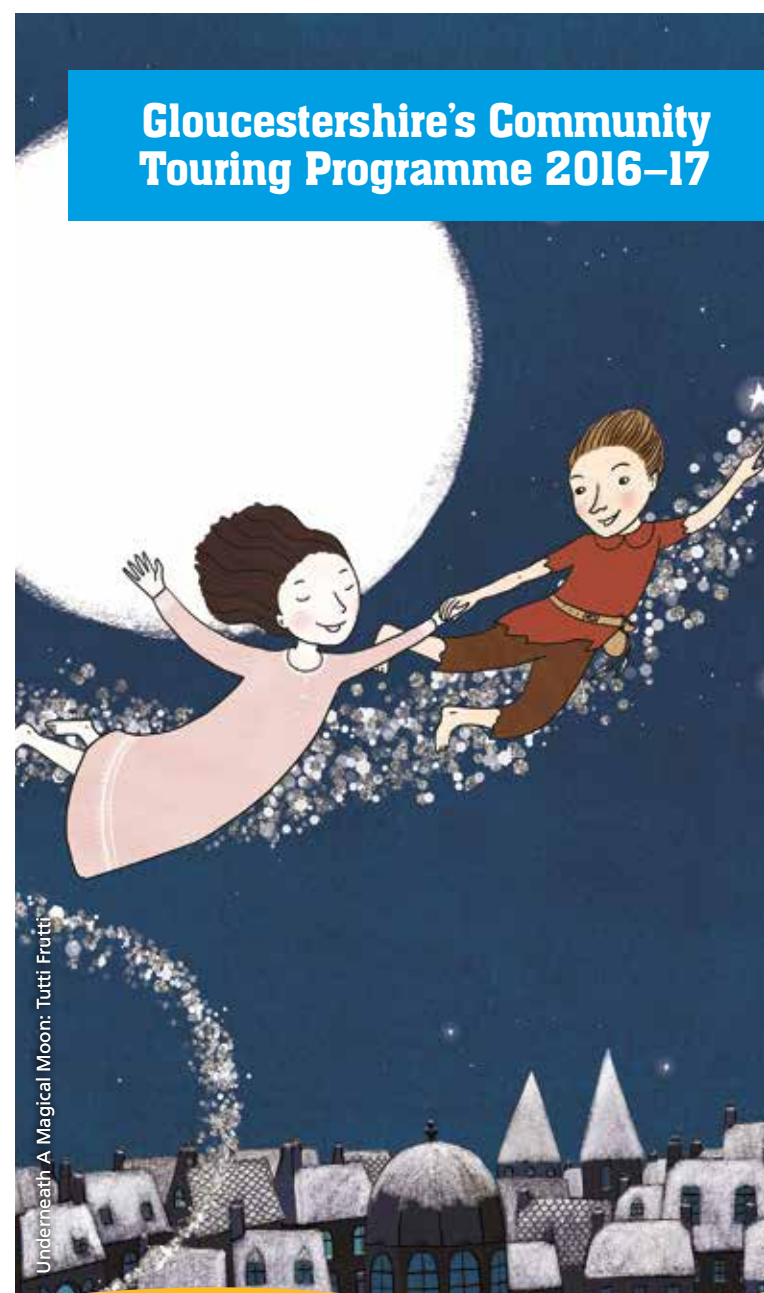
Underneath a Magical Moon: Tutti Frutti

This Events Guide is available in large print. Please call 01989 566644.